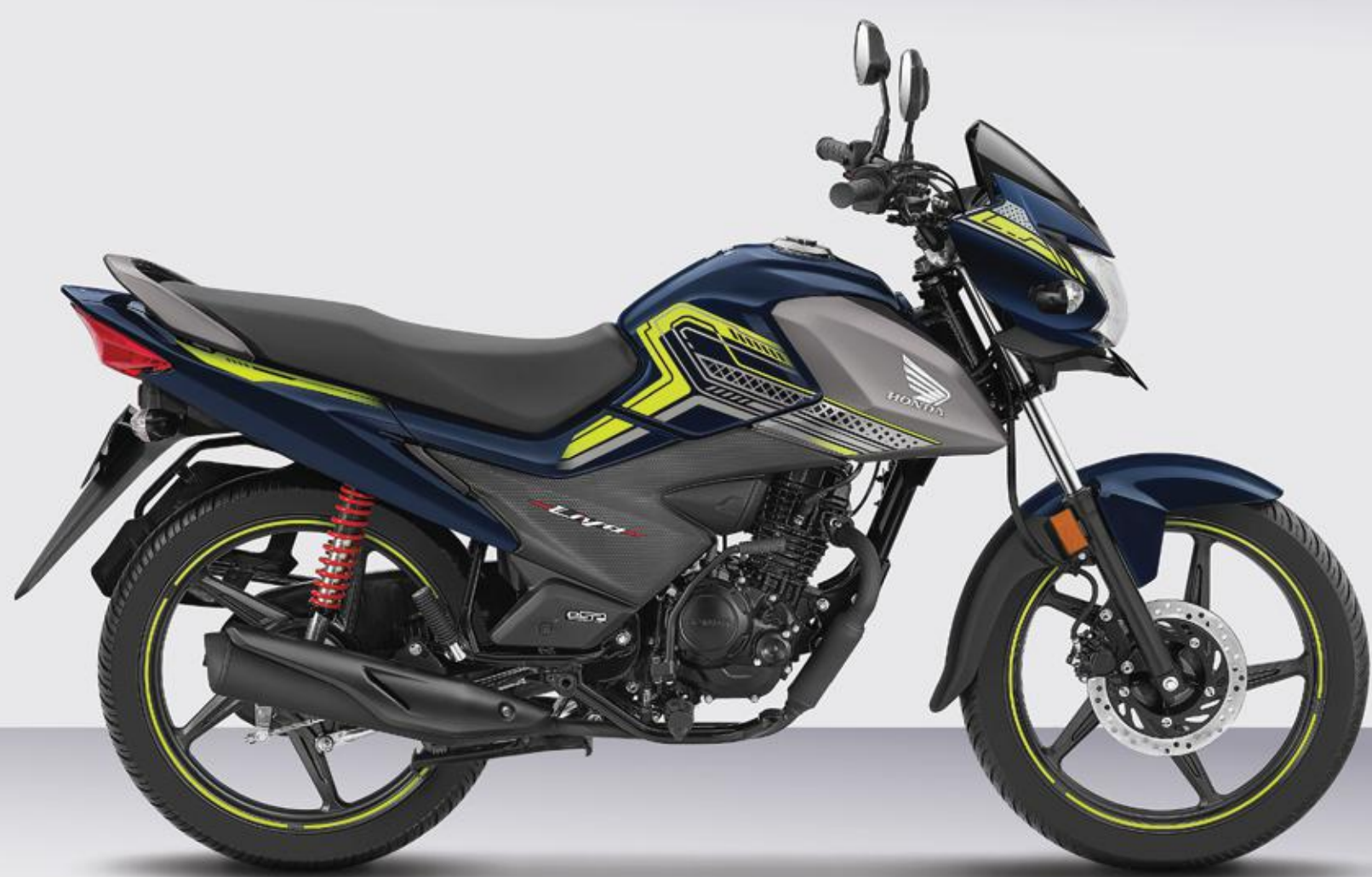
PEARL SIREN BLUE A (Geny Gray Shroud + Green Stripes)