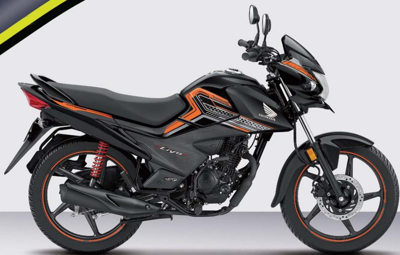
PEARL IGNEOUS BLACK (Pearl Igneous Black Shroud + Orange Stripes)